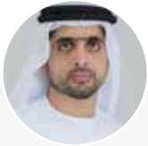
HH Sheikh Mohammed Bin Maktoum Bin Juma Al Maktoum